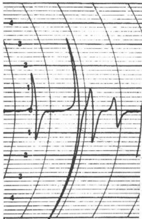
FIG. 1. The above reproduction illustrates typical signals obtained from BaTiO 3 crystals, in the ferroelectric state corresponding to room temperature, and polarized perpendicular to the direction of the dc magnetic field produced by the V-4007 Electromagnet and V-2200 Power Supply. The resonant frequency of the V-260 Klystron was set at 9.5 kMc/sec.

PARAMAGNETIC resonances consisting of several components have been observed at microwave frequencies in single crystals of barium titanate, 1 which contain small amounts of iron. Figure 1 illustrates the nature of the observed lines obtained at room temperature from a single crystal polarized in a direction perpendicular to the plane of the crystal, and to the direc-